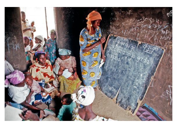
Women Attending Literacy Class in Nigeria

to education in Nigeria, partnering Nigeria's Ministry for Education, the UN and other international aid agencies. The initiative outlines a comprehensive approach through civil society and local governance to address the wide gender gap in education. 940 The most marginalised areas of the country in the North have the greatest disparity of boys and girls in education and literacy. 941