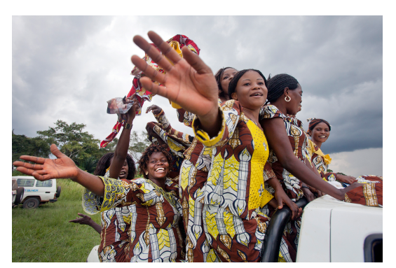
Congolese Women Welcome UN Deputy High Commissioner for Human Rights

levels of governance, justice and security reforms.