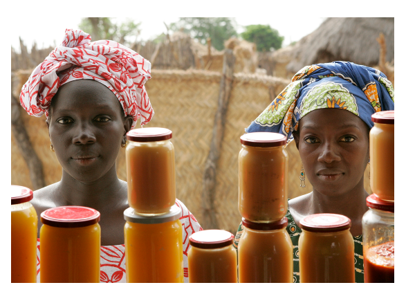
Rural Women Selling Mango and Potato Jam