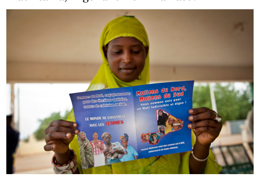
Young Woman Read Peace Caravan Flyer in Gao, Mali

The 2012/13 conflict has made women more vulnerable to sexual and physical violence and such abuses are on the rise, especially in Northern Mali. <sup>876</sup> The United Nations estimates thousands of women in Mali are survivors of sexual assault by the rebels. <sup>877</sup> Following the unrest, UNHCR reports that "basic services are no longer provided to the population, and violations of human rights have been reported. As a result of the presence of heavily armed groups, Northern Mali is largely inaccessible to humanitarian actors ."<sup>878</sup> Hence, approximately 200,000 Malians have found refuge in neighbouring countries: Mauritania, Niger and Burkina Faso.<sup>879</sup>