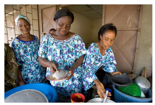
Restaurant Run by Women in Cote d'Ivoire

War and conflict also act as a barrier to women's land ownership in Cote d'Ivoire. Hundreds of thousands of people fled from their farmland during the turmoil over the past ten years, leaving swaths of land up for grabs. Women who lost husbands or brothers during the crisis returned to find that they no longer had claim to what was rightfully theirs. Land conflicts in this resource —rich country has led to extreme violence and unmitigated insecurity for women. One woman who found herself in this situation said: "I cannot resort to violence. I can't do anything as a woman."