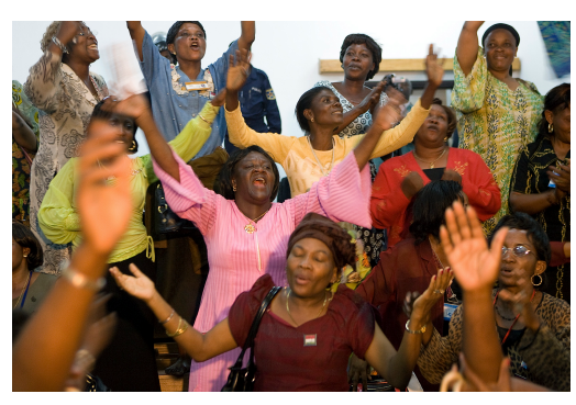
Congolese Women Rejoice after Signing Peace in Goma

In light of the escalation in violence this year, the UN brokered a peace deal in February 2013 in Addis Ababa and the International Conference on the Great Lakes Region (ICGLR) facilitated talks between the DRC and the M23 in Kampala. Mary Robinson highlighted the importance of the role of women in the peace process. 94 Despite these spoken promises and peace negotiations that brought together an impressive number of diplomats and heads of state, "the inclusion of women's voices in the formal process of peacemaking appears to have been limited."95