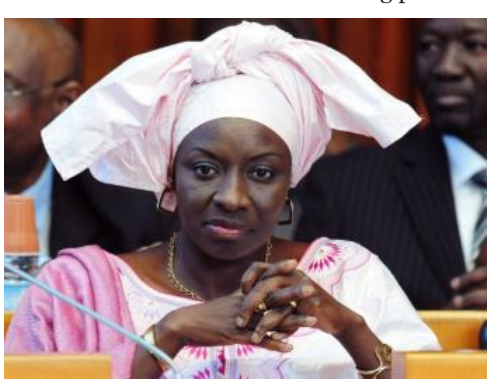
Aminata Toure, Senegal Prime Minister

proportional representation contest (PR) and the seats contested through a plurality/majority contest in multi-member constituencies."955 It is clear that the quota law has acted as a turning point for women's political participation in Senegal, allowing for small, but important steps being made at all levels for women in decision-making positions.