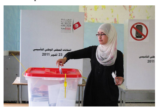
Tunisian Woman Voting at the 2011 Election

Tunisia is currently experiencing growing political unrest with the murder of two leading politicians by suspected Islamist militants of Ennahda. Opposition parties demonstrators are demanding for dissolution of Ennahda Islamist Party in favour of a unity government that would represent the broadest form of consensus. Ennahda government announced that it would not step down despite growing opposition protests.500 Recently, however, after protests intensified, the Islamist-led government has agreed to resign after talks with opponents that were held in early October.<sup>501</sup> Under the deal signed after talks in Tunis, a cabinet of independent figures will be in power until fresh elections.502