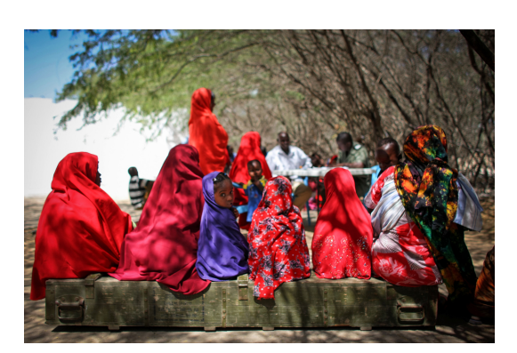
Somali Women & Girls Wait to See a Medical Officer

The HIV rate in Somalia is very low, at below 1%, however the actual prevalence HIV/AIDS may be higher due to the widely held perception that it is related to 'illicit' sex and women's reluctance to seek medical support.<sup>328</sup>