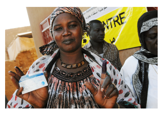
A South Sudanese Vote in Historic Referendum

plans to increase the women participation quota to 35% affirmative action at all levels of government in South Sudan. Although this is good news, affirmative action must be translated into legislation to have effective force of law.<sup>475</sup> Until the legislation is passed, women will comprise 25% of all government positions as outlined in the 2011 constitution.