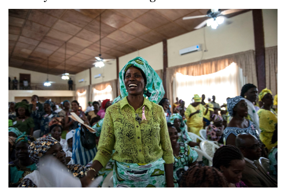
Liberian Women Honour President Sirleaf in Thanksgiving Event

led groups, are advocating for peace and security institutions to integrate women."856