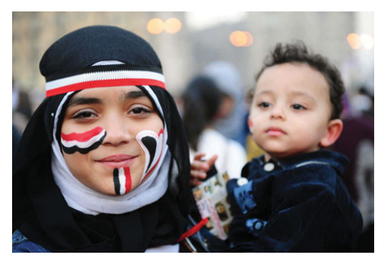
Egyptian at Tahir Square Celebrating the Fall of Mubarak Government

poor households and are wage earners for their families.