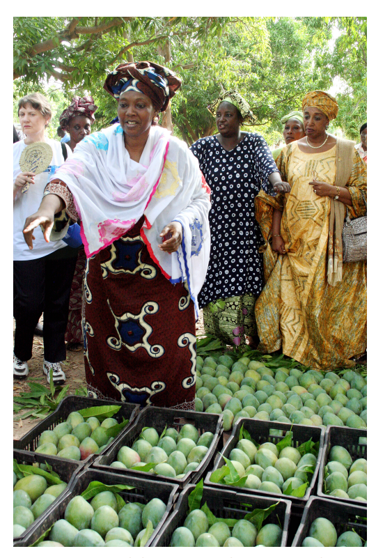
UNDP Head Visits Four African Countries to highlight Progress on MDGs

Joyce Banda, the first female president of Malawi, continues to advocate for women's empowerment and gender policy reforms. And in July 2013 Burundi hosted a three-day conference of female leaders from across the Great Lakes region to develop a road map for engaging women in peace processes and implementing the 'Peace, Security and Cooperation' (PSC) Framework and the UNSCR 1325. 138