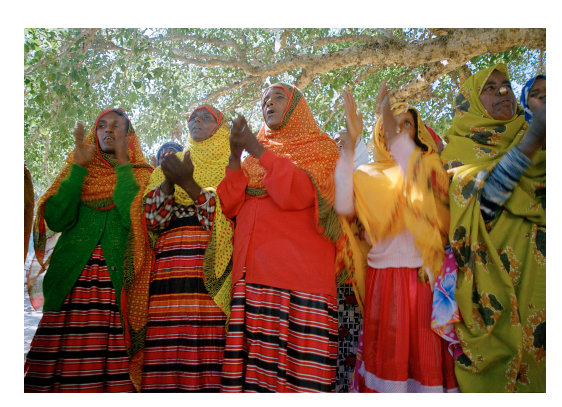
Women at Herena Camp for Internally Displaced Persons

Women, provides services, runs job-training programs, and advises the government on women's issues, but it does not engage in public advocacy, and it has repeatedly blocked efforts to organize independent women's groups. 185 According to the inter-parliamentary Union, 186 Eritrea parliament has 33 women constituting 22% of the 150 seats, based on the country's first elections since independence from Ethiopia in 1994, the only general election to be held to date.