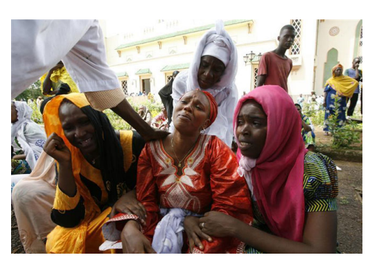
Bloody Monday: The September 28 Massacre & Rapes by Security Forces

Following the violence during the 2009 popular uprisings, a Guinean police officer was finally arrested and charged for the rape of a woman in the Stadium of Conakry in May 2013. See As women were specifically targeted during the 2009 uprising, and few perpetrators have yet been punished for their crimes, the fight against impunity must remain a priority, according to the UN. See